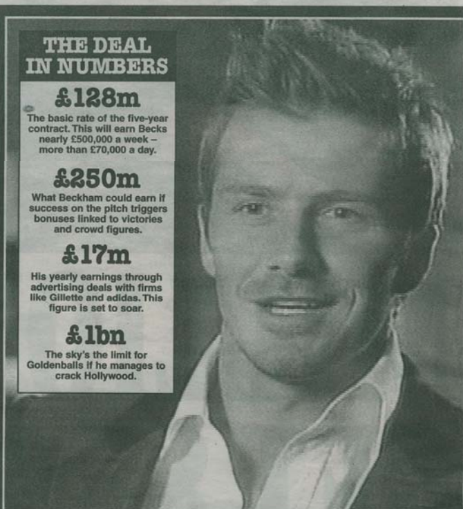
GALAXY-BOUND: David Beckham announcing his switch to Los Angeles yesterday

The sky's the limit for Goldenballs if he manages to crack Hollywood.