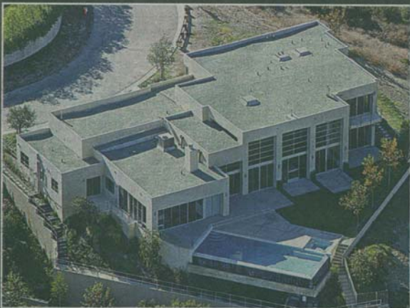
TARGETED: One of the luxury US properties viewed by wife Victoria recently