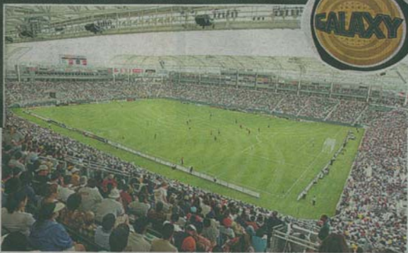
HUMBLE HOME: The Galaxy stadium is a far cry from Real Madrid's ground